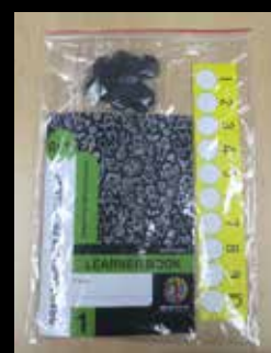
1 x learner pack