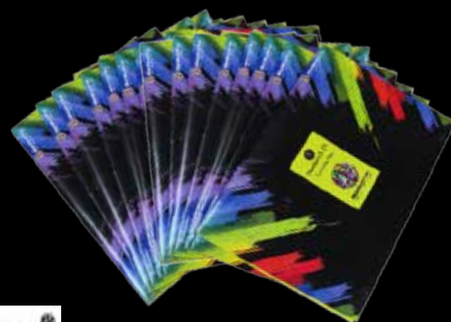
14 x differently-themed A4 books