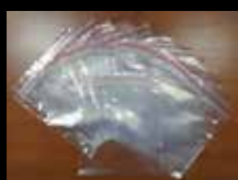
16 x Ziplock bags