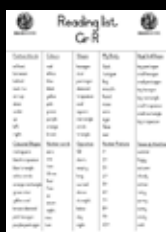
1 x Homework reading list