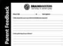
Parent Feedback Form