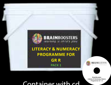
Container with cd