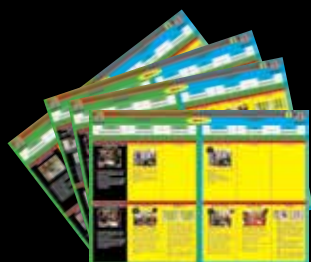
4 x Daily Activities Posters