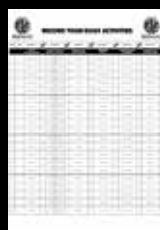
1 x Record your daily activities