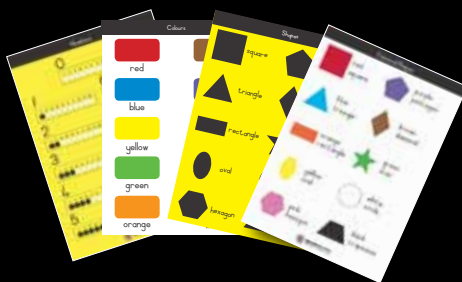
4 x differently-themed A3 posters